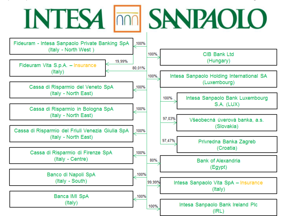
Chart 1: Principal subsidiaries and investments of Intesa Sanpaolo S.p.A.

The principal subsidiaries and investments of ISA can be found in the following chart: